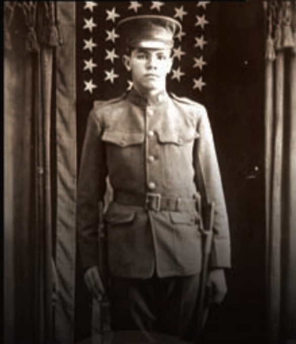
Unknown World War I soldier with visible honor

But over the centuries the influence of Christianity gradually forced the Western honor culture to evolve. The first point of intersection between religion and honor came with the idea of the Christian knight which developed out of the crusades in the Middle Ages. Although this ideal figure took on a spiritual dimension in the later French romances that dealt with the legends of the Holy Grail, for the most part he was a warrior on behalf of Christian symbols and rituals whose ethical side was not of much interest, apart from the highly developed forms of courtesy with which he was expected to treat both his lady and his enemies. Chivalry, as these codes of behavior came to be known, remained class-bound and of limited relevance to most people for centuries until it was re-invented by the romantics,