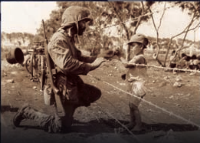
Honor clearly evident by the actions of this WWII soldier

side. They liked to think of themselves as “just doing a job” and even, to an extent, fighting against the ideas of honor as expressed in the self-conscious primitivism of the Nazis or the code of bushido among the Japanese. By the time of the Vietnam war, honor itself seemed to many to have become dishonored. When President Nixon claimed to seek “peace with honor” in Vietnam, it was widely understood to mean nothing but a fig leaf to cover an ignominious American retreat.